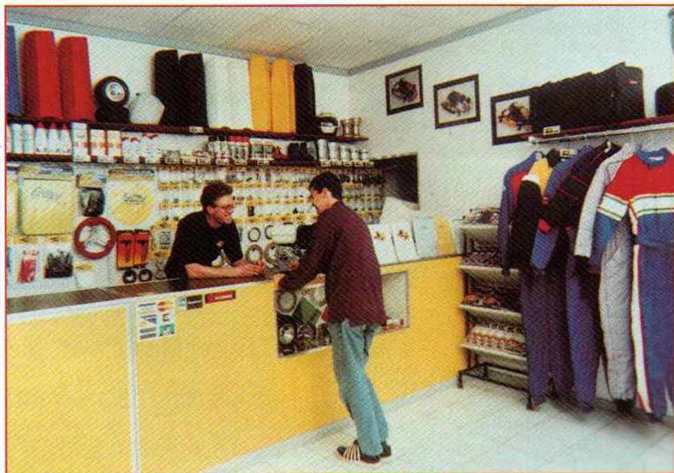
The fully stocked shop area

With new premises, new management infrastructure and an ever expanding product range, Kartpro Stratos Leisure face the new millennium with confidence in an increasingly competitive marketplace. Their confidence looks well founded.