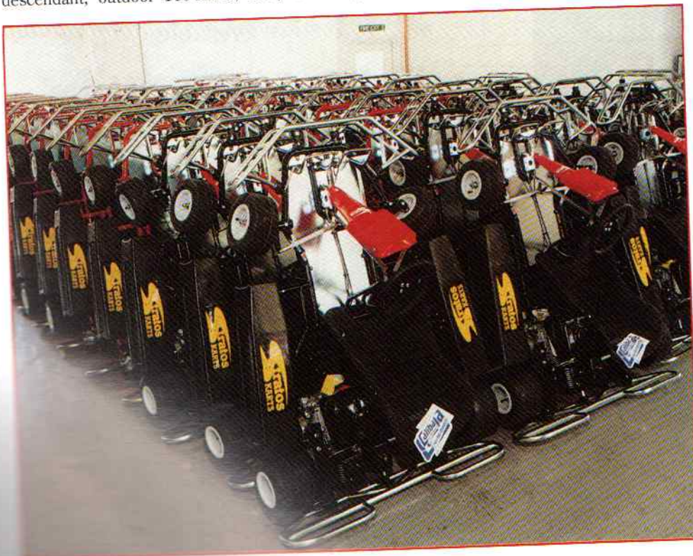
Order ready for dispatch

Whilst the company's main activities in recent years have concentrated on the four