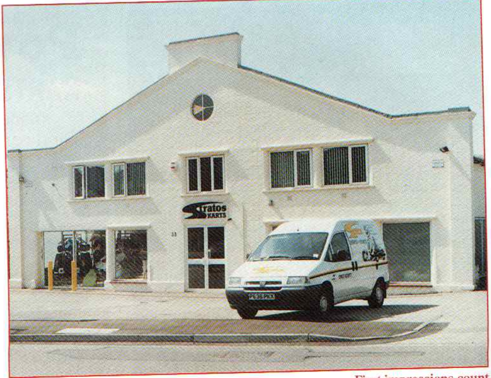
First impressions count