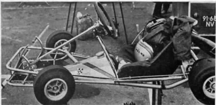
Two of the Norwegian drivers entered these smart looking Shark karts with attractive tapered fuel tanks and adjustable pedal pivots.