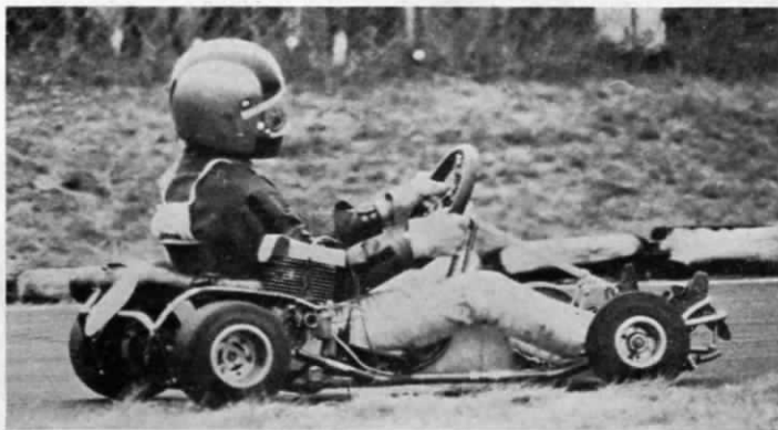
Top drivers these days appear to have very long legs—could it be that this provides better weight distribution?