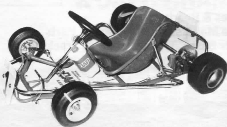
Tabor supplied this illustration of the DAP Cadet that they ▼ market.