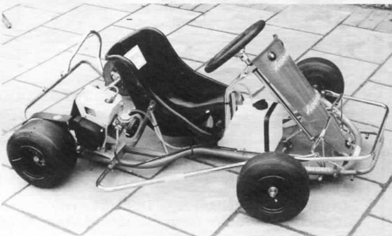
Above & below, Dartford Karting's Dart Cadet that sells well below the RAC maximum because VAT'S included in the £670 price