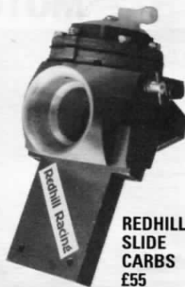
REDHILL SLIDE CARBS £55

Superdart A frame A890 — CIK homologated for 1988/1989/1990. Complete kart less wheels and tyres, assembled, fitted with adjustable castor/camber, 30mm rear axle, 30mm tubing, 3 bearing axle & includes seat. Usual price £425, but as an introductory offer the first 40 only will be available at the special price of £300 + VAT.